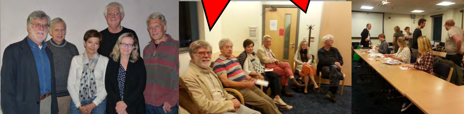
The Successful Neighbourhood Plan Team/At "The Count!"/The Counting Room and Returning Officer

It's a Resounding "YES" for the Neighbourhood Plan!