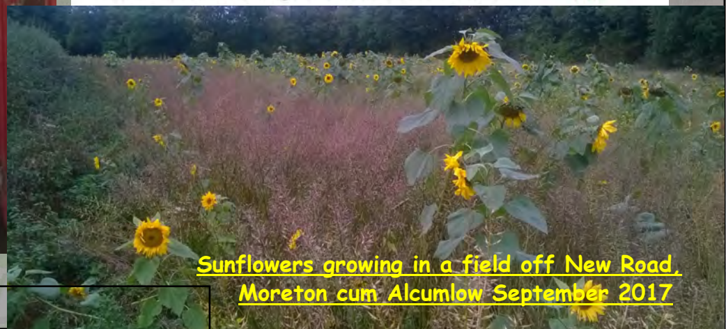
Sunflowers growing in a field off New Road, Moreton cum Alcumlow September 2017