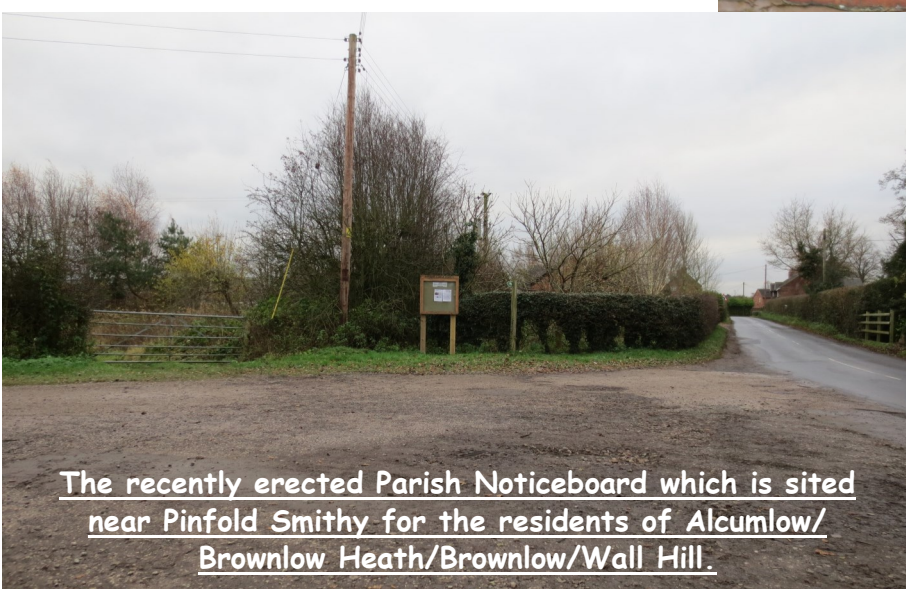
The recently erected Parish Noticeboard which is sited near Pinfold Smithy for the residents of Alcumlow/Brownlow Heath/Brownlow/Wall Hill.

This event is a wonderful start to the Christmas celebrations and portrays the real meaning of Christmas. All proceeds will be going to the church and church ramp funds.