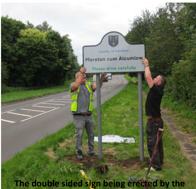
The double sided sign being erected by the team from Nuneaton Signs.

The signs are on the A34, south of Congleton, north of Little Moreton Hall (for Moreton cum Alcumlow) and on the border between the two parishes near Moreton Cottages (with one name on either side).