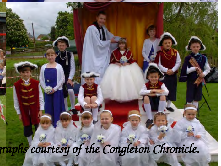
Astbury May Day 2016.