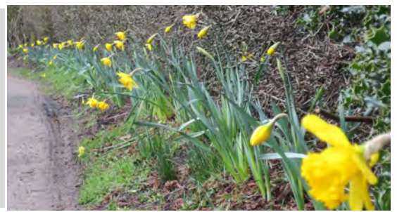
Unseasonal colour: Daffodils in flower, Brook Lane, Alcumlow, February 18th. 2016

Website: http://astbury-parish.org.uk email: astcfp@tesco.net