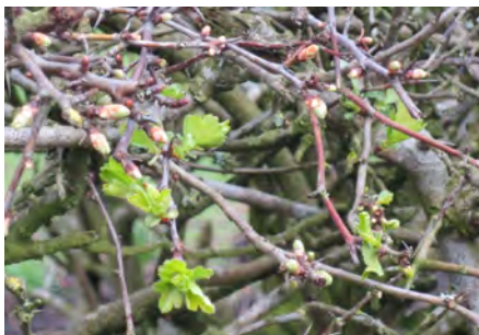
Unseasonal leaves: Hawthorn on Chance Hall Lane, Alcumlow. February 16th. 2016